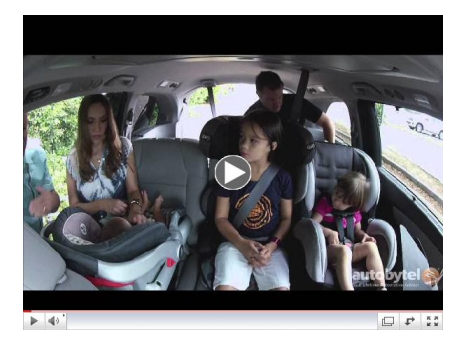
Fitting 3 Car Seats Across the Rear Seat