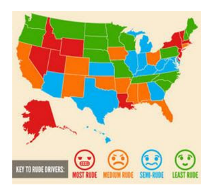
Read full article

As the current training contract comes to a close, Vera and I would like to send a huge 'thank you!' to everyone in Colorado that participated in CPS Training this year. We are truly honored to have been